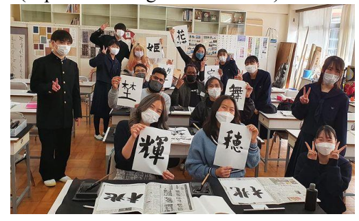
School visit - Calligraphy experience (April 2022)

International GBC students also learned about Japanese confectionery "wagashi," manufacturing, marketing, and selling. Moreover, representatives from Takayamado Confectionary Company in Hyogo Prefecture taught students about the historical development of Japanese confectionery, including "dagashi" (inexpensive and popular snacks) and modern business trends. GBC students also gave presentations on traditional confectionary products from their home countries, identifying differences and similarities in consumers' tastes and proposing ideas for importing and exporting sweets. In addition, with the cooperation of Takayamado and the Hyogo Confectionery Industry Association, Japanese confectionery professionals taught students how to handmake two common types of wagashi; cherry and maple.